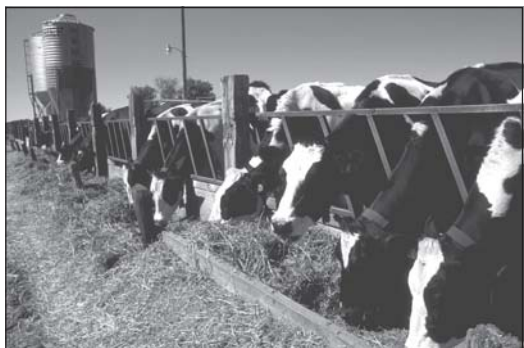
Growing data on emissions from San Joaquin dairies called into question California's exemption of agriculture from the Clean Air Act.

Based on the information disclosed during the Borba permit process, the effects of dairies began to gain local and statewide attention. Local papers, including the Bakersfield-Californian and the Fresno Bee, began publishing editorials critical of dairies practices.