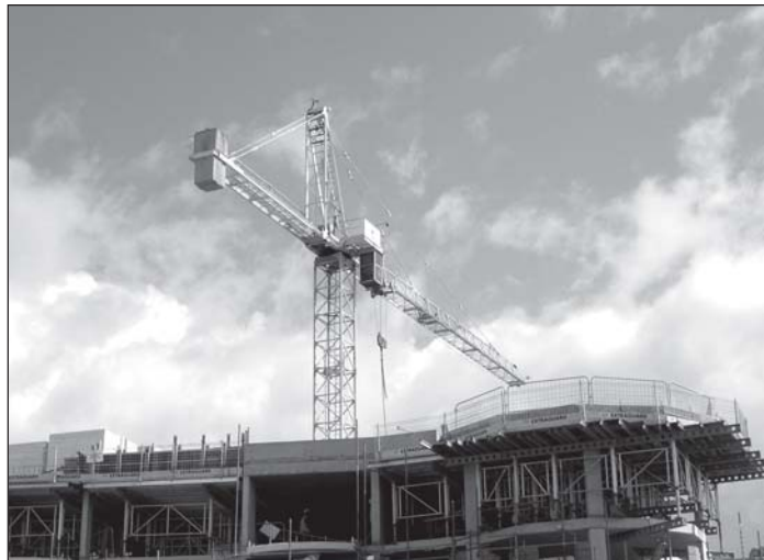
Construction sites expose workers, nearby residents, and children to elevated concentrations of dust and diesel exhaust.

sion. Expert analysis indicated that construction of the berths and increased truck and cargo traffic would result in adverse public health impacts in the surrounding community. After extensive negotiations,