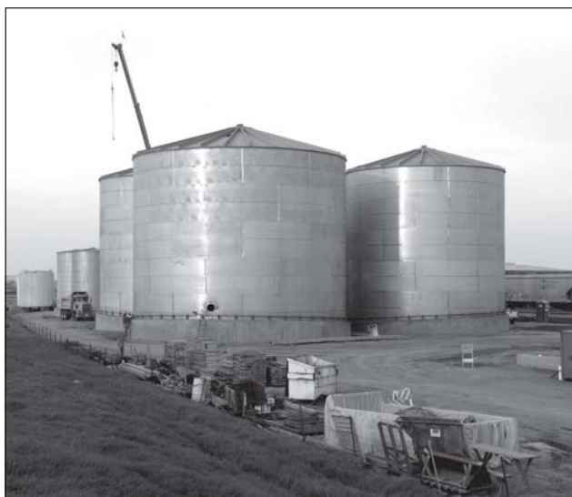
In the CEQA settlement agreement, the plant owners agreed that if VOCs are found to exceed two pounds per day the plant will install best available control technology to reduce emissions below that level.

Ultimately, the parties reached an agreement that resulted in numerous mitigation measures to reduce project impacts. Of particular importance, the plants agreed to retain an independent consultant to monitor volatile organic compounds (VOCs) from the wet mash or wetcake produced at the plants. If volatile organic compounds are found to exceed two pounds per day, the companies agreed to install best available control technology to reduce emissions below that level. No emission factor currently exists for these emissions and they would have gone unanalyzed and unmitigated under the County's Negative Declaration.