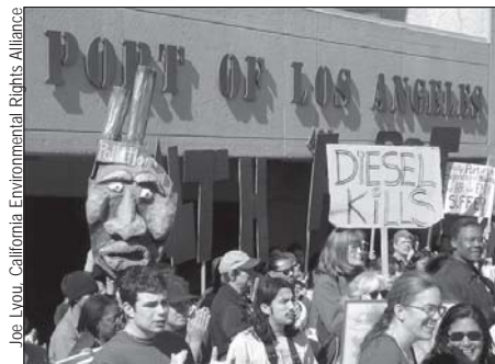
Over 100 people gather to protest excessive air pollution at the Port of Los Angeles.

In June 2001, after decades of expansion by the Ports of Los Angeles and Long Beach without mitigation of the environmental impacts, local community members joined forces with the Natural Resources Defense Council and Coalition for Clean Air to challenge the Port of L.A.'s approval of a 174-acre terminal expansion for the China Shipping Container Line. According to port documents, as many as 250 of the world's largest container vessels planned to call at the terminal, with cargo being moved by as many as 1 million trucks on local streets every year.