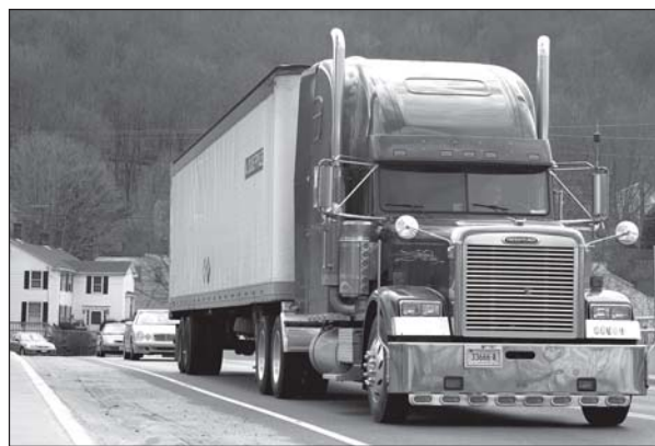
Mobile sources, including vehicular traffic, street sweeping, garbage pick-up and landscape maintenance, increase emissions after a project is built, affecting air quality and public health in the local community.

labor unions and their members reviewed the MND, submitted extensive comments on the project and proposed additional mitigation measures to reduce the project's impacts.