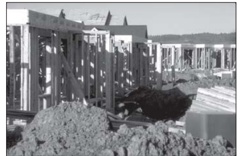
The Brookings Institute found in a 2001 study that Bakersfield was the worst sprawling city in California. As the city grows, residents suffer from worsening levels of air pollution.

New developments spring up primarily at the edge of the city, meaning more commuting to get to downtown jobs. In fact, the number of vehicle miles traveled in Kern County has grown at twice the rate of population since 1981. Combine car travel, fireplaces, gas lawn mowers, construction emissions and a host of other pollutant sources, with the natural bowl shape of the local topography, which traps bad air in the city, and it's no surprise that residents endure an average of twenty-five "Save the Air" days per year.