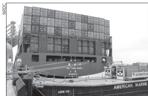
A cargo ship plugs into the new electric power station at the Port of Los Angeles. Because of CEQA, China Shipping will be one of the first “green” terminals in the state and will include a number of other measures intended to minimize its negative impacts on nearby communities.

gas or propane, 100 percent of other yard equipment to install pollution controls and use cleaner diesel fuels, and installation on the second wharf