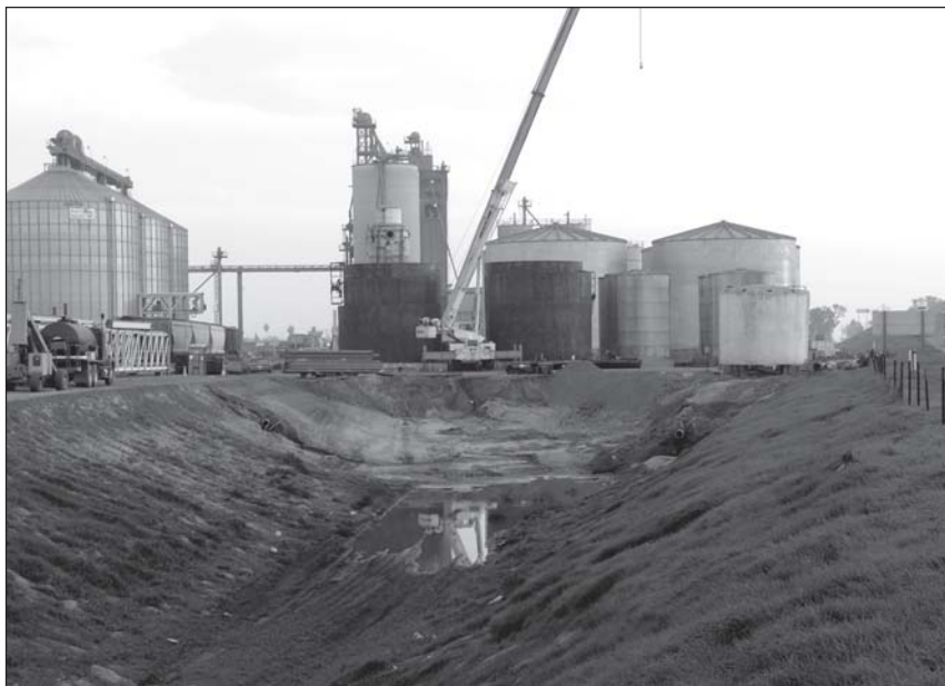
Construction continues on the Western Milling ethanol plant in Goshen, CA. The Pixley plant will be built just thirty miles south.

While there are currently no operating ethanol plants in California, many mid-western ethanol plants have been identified as major sources of air pollution and odors. For example, many ethanol plants built in the Midwest prior to 2000 had exceeded their air permits by hundreds of tons, and