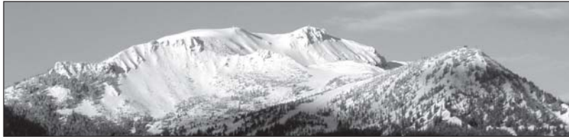
Mammoth Mountain overlooking the town of Mammoth Lake in Mono County. In 1971, when the Mono County Planning Commission approved plans to build six buildings up to eight stories tall in the small resort town, a group of residents filed the first CEQA suit for a private development. The resulting Friends of Mammoth v. Board of Supervisors decision recognized that private development projects must undergo environmental review pursuant to CEQA.

Los Angeles . In No Oil , the Court was confronted by a shabby evasion of CEQA, where the city council—without having the analysis of an Environmental Impact Report (EIR) before it—made the essen-